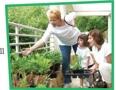
Learn about herbs in Gahanna, the Herb Capital of Ohio

Head to Gahanna , known as the Herb Capital of Ohio. Shop for herbal tea and soap at the Ohio Herb Education Center and stroll its herb gardens. Check out the new Creekside shopping and dining district and stop in for a freshly made pastry at the Bread Basket Family Bakery before renting a paddleboat to meander along Big Walnut Creek.