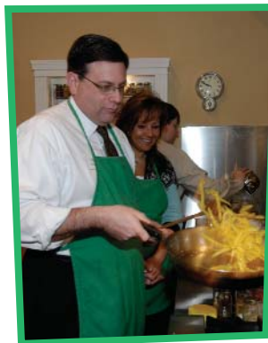
Cook tempting meals at Woodhaven Farm

Start off in the Short North at Tasi Cafe , where the breakfast choices are so good they're served all day.