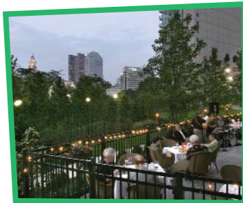
Romance awaits at M

Stay at Easton for dinner and a performance by Shadowbox , a theater troupe presenting hilarious comedy skits and sexy rock 'n' roll performances. Or head to one of Columbus' award-winning romantic restaurants. M , local restaurateur Cameron Mitchell's marquee restaurant, offers one of the best views of the downtown skyline from its outdoor terrace. The Refectory , set in a restored 1800s church, serves French cuisine in an intimate setting and has one of the best wine collections in the country.