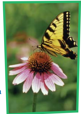
Franklin Park Conservatory

Go on an organized scavenger hunt in German Village to learn about the neighborhood, which is listed on the National Register of Historic Places. Eat lunch at Schmidt's Restaurant und Sausage Haus . For dessert, stop at Graeter's Ice Cream , where you can see ice cream being made from start to finish.