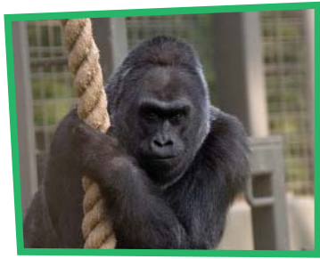
Columbus Zoo and Aquarium

Interact with exotic animals up-close and learn from the experts after a full breakfast buffet. Take a guided tour before the gates open to the public. Cool off at Zoombezi Bay , the zoo's new waterpark.