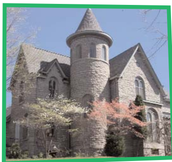
Delaware Arts Castle

Create your own topiary at Delaware's Foertmeyer & Sons Greenhouse and explore greenhouses and outdoor gardens. Experience life as a farmer at Stratford Ecological Center , where you can do everything from feeding animals to helping with crops. Also in Delaware, you can gaze at the galaxies at Perkins Observatory or take an art class at the Delaware Arts Castle .