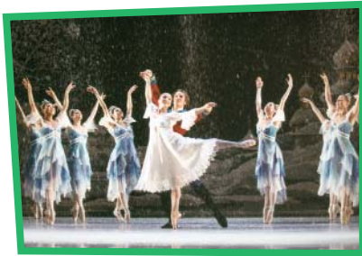
BalletMet's "The Nutcracker"

Choose from several options for the evening. Be surrounded by millions of twinkling lights at the Columbus Zoo and Aquarium during Wildlights, a festival holiday celebration starting mid-November. Be sure to visit the reindeer and decorate your own holiday cookies. Or enjoy a holiday performance by one of Columbus' many arts groups, including the Columbus Jazz Orchestra's Home for the Holidays, The Columbus Symphony's Holiday Pops, ProMusica Chamber Orchestra's "Messiah" Side-by-Side Sing Along and BalletMet's "The Nutcracker."