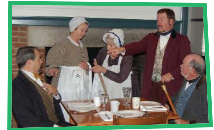
"Dickens of a Mystery"

Figure out "whodunit" at the entertaining "Dickens of a Mystery" at the Ohio Village . Enjoy a hearty meal while you interact with a historic cast of characters and strive to solve the mystery of this Ohio Village original theater performance.