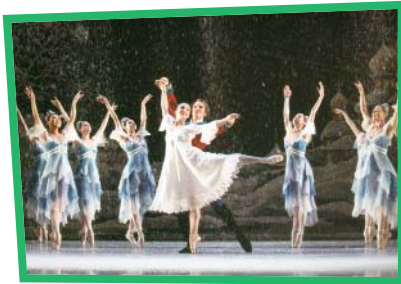
BalletMet's "The Nutcracker"

Choose from several options for the evening. Be surrounded by millions of twinkling lights at the Columbus Zoo and Aquarium during Wildlights, a festival holiday celebration starting mid-November. Be sure to visit the reindeer and decorate your own holiday cookies. Or enjoy a holiday performance by one of Columbus' many arts groups, including the Columbus Jazz Orchestra's Home for the Holidays, The Columbus Symphony's Holiday Pops, ProMusica Chamber Orchestra's "Messiah" Side-by-Side Sing Along and BalletMet's "The Nutcracker."