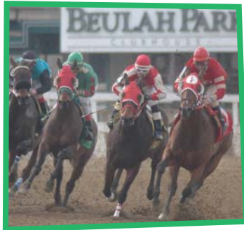
Get to the races