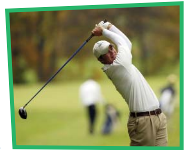
Hit the links

After breakfast at the hotel, hit the links. Central Ohio has more than 100 public and private courses —many ranked among the best in the nation or designed by the world's top course architects.