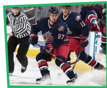
Cheer on the NHL's Blue Jackets

Grab dinner and a couple of pints at one of Columbus' microbreweries. Among your choices are the Columbus Brewing Company , the Elevator Brewery & Draught Haus and Barley's Brewing Company , the city's oldest continuously operated brew pub. All make handcrafted, award-winning beers.