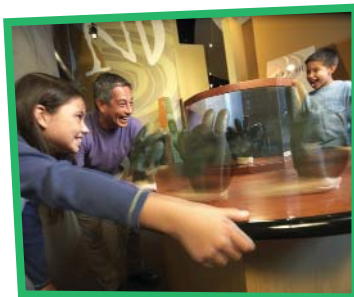
Learning is fun at COSI

Start your vacation at COSI , the No. 1 science center in the country for families according to Parents magazine. Split a laser beam in Gadgets, use sonar technology in Ocean or pilot a space capsule in Space. There's also little kidspace, geared to children in kindergarten and younger.