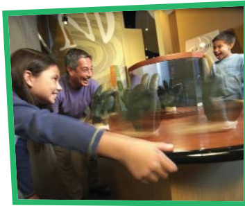
Learning is fun at COSI

Start your vacation at COSI , the No. 1 science center in the country for families according to Parents magazine. Split a laser beam in Gadgets, use sonar technology in Ocean or pilot a space capsule in Space. There's also little kidspace, geared to children in kindergarten and younger.