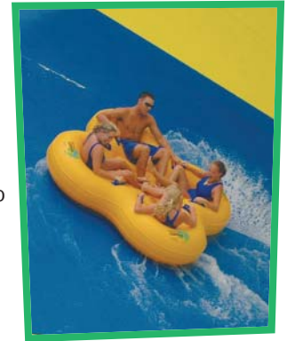
Splash away at Zoombezi Bay

Make a big splash at Zoombezi Bay water park, located next to the Columbus Zoo and Aquarium . Dry off to see rare and endangered animals, hand feed lorikeets and walk amid kangaroos. Admission to Zoombezi Bay includes the world-famous zoo.