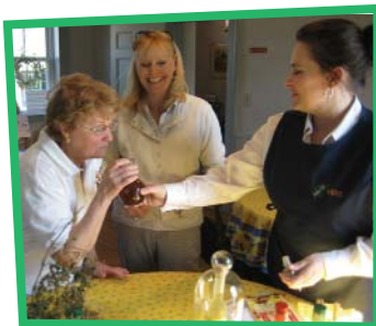
Create herbal treats in Gahanna

Discover why Gahanna is known as the Herb Capital of Ohio. Turn ordinary garden herbs into extraordinary varieties of pesto. You'll also learn how to use herbs to do everything from creating one-of-a-kind herbal teas to culinary treats like herb-infused vinegar.