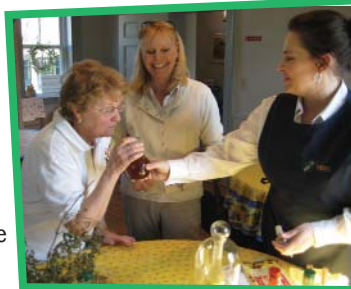
Get creative with herbs in Gahanna

Discover why Gahanna is known as the Herb Capital of Ohio. Learn how to use herbs to do everything from creating tea to vinegar and pesto.