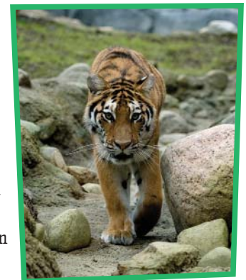
Columbus Zoo and Aquarium

Eat breakfast with the animals at the Columbus Zoo and Aquarium . Interact with exotic animals up-close after enjoying a full breakfast buffet. Find out more behind-the-scenes details on a guided walking tour, before the gates open to the public.