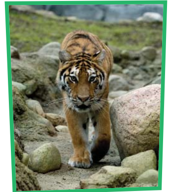
Columbus Zoo and Aquarium

Eat breakfast with the animals at the Columbus Zoo and Aquarium . Interact with exotic animals up-close after enjoying a full breakfast buffet. Find out more behind-the-scenes details on a guided walking tour, before the gates open to the public.