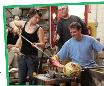
Watch glassblowers at work at Glass Axis

Eat lunch amid works by Dale Chihuly and other preeminent glass artists at Hawk Galleries .