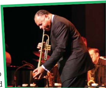
Go on stage to meet jazz greats

Get VIP treatment at one of two evening options. Enjoy live jazz from one of the world's finest big bands, the Columbus Jazz Orchestra . Start the evening with an all-access tour of the historic Southern Theatre and meet Byron Stripling, the former lead trumpeter and soloist with the Count Basie Orchestra. After the concert, go on stage for an exclusive opportunity to meet the 17-member band. Or go behind the curtain at Broadway's biggest hits, courtesy of Broadway Across