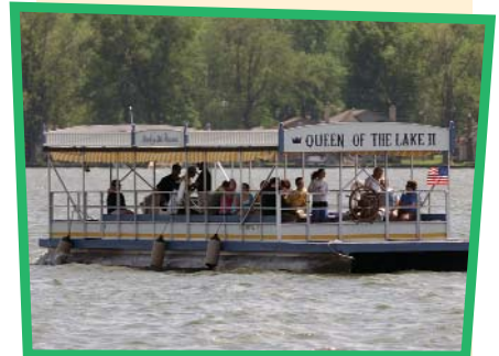
Queen of the Lake II