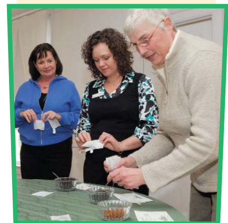
Robbins Hunter Museum