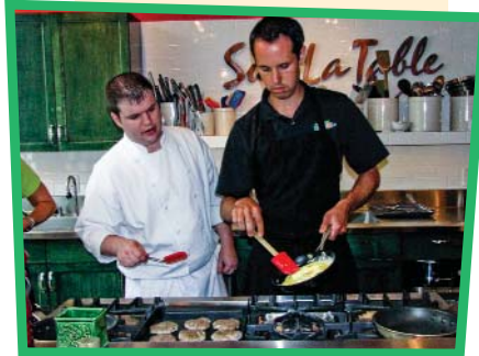
Take steps to becoming a top chef at Sur La Table

Rather shop for the latest fashions? Go inside Nordstrom before it opens for the day and enjoy a private, full hot breakfast at the Cafe Bistro. Get expert advice on the must-have fashions and