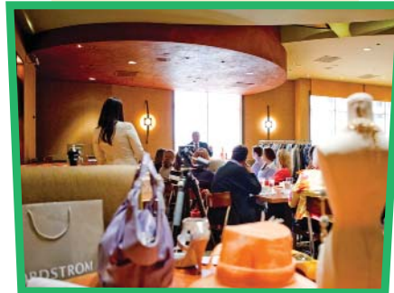
Find out what's in fashion at Nordstrom