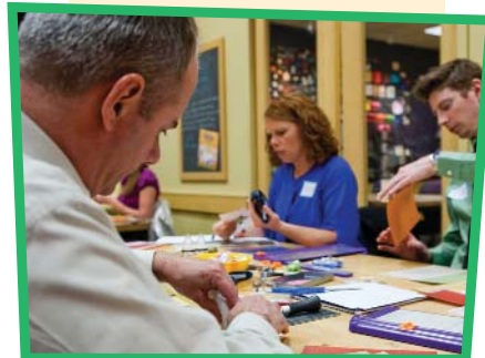
Create memories at Archiver's

accessories for men and women. Free alterations and complimentary makeovers are available.